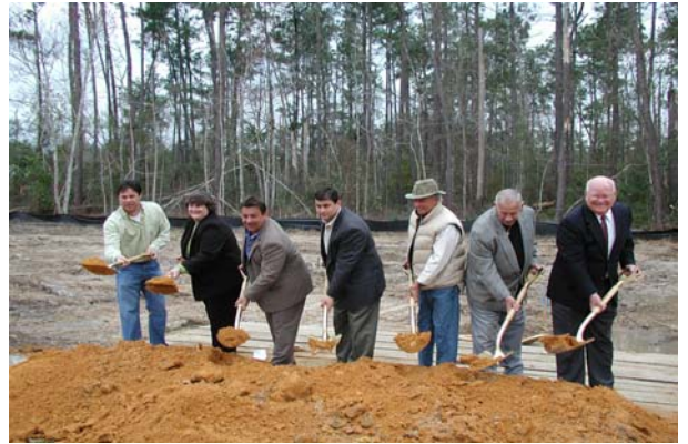
Groundbreaking with Hancock County Utility Authority and Kiln Water and Fire District representatives