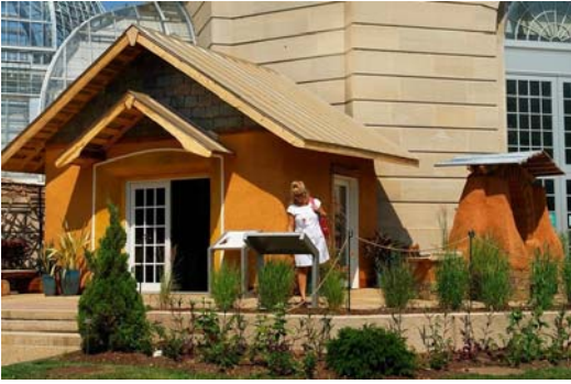
Straw Bale House at U.S. Botanic Garden

The film showcases green techniques that are being used in urban areas to reduce the effects of storm-