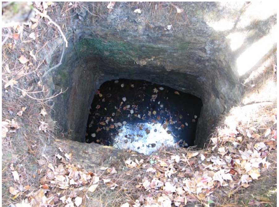
10' x 11' x 23' deep flooded vertical air shaft near Ackerman, Choctaw County

It is DEQ’s intent, given landowner permission, to reclaim these sites to eliminate hazardous situations. The air shafts are 11 and 23 feet deep with vertical walls. Anyone accidentally falling into one of them would be trapped if they were alone. The remainder of the roof of the mine near Louisville could collapse at any time and crush or trap anyone in it. Fishing in the shallow surface mine near Reform is not planned to be disturbed.