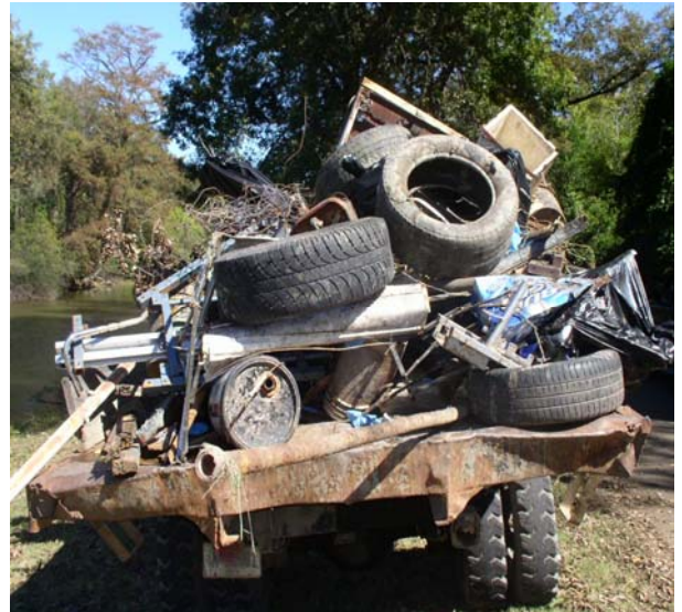
Result of clean-up activities—Deer Creek Watershed

MDEQ has provided funding for the Northwest Mississippi Resource Conservation and Development program in partnership with the Deer Creek Watershed Association and others to conduct clean-up events in communities along Deer Creek and implement an educational and outreach program. The Deer Creek Watershed Association is a locally-led organization with the purpose of addressing issues on Deer Creek. The effort is led by a steering committee consisting of local landowners, residents, stakeholders, municipal and county officials. Thirteen clean-up events were held in the seven communities of Anguilla, Arcola, Cary, Hollandale, Leland, Rolling Fork, and Metcalfe. Over 1,100 volunteers contributed 3,353 hours of volunteer service. To increase awareness among young people, a Deer Creek Essay Contest was conducted in nine schools along Deer Creek. The theme of the contest was “Why is Deer Creek Important.” Awards were presented for 1 st , 2 nd and 3 rd places.