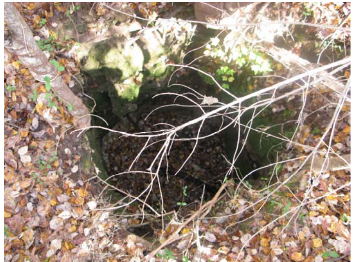
6' x 8' x 11' deep dry, vertical air shaft at Russell, Lauderdale County

An even greater surprise would be finding out that 100 years ago there were a number of lignite mines around the state. Granted, these mines were very small and short lived, but some did exist.