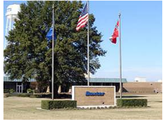
Baxter facility in Cleveland

Baxter pursues voluntary programs such as enHance because they are based on the premise that environmental programs should go beyond complying with government regulations to strive for continual improvement. Operating a proactive environmental program rather than a compliance-based program helps reduce Baxter's regulatory burden and yields savings for the company. Baxter's proactive program also produces savings and other benefits that are not easily measured, such as increased good will, reputation, brand value, increased sales, and improved employee morale.