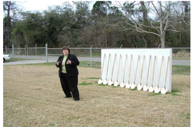
The gold shovels are ready for the Gautier and Escatawpa projects' groundbreaking