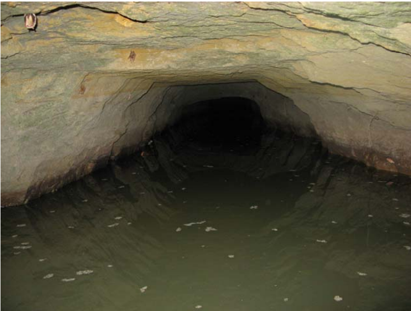
Partially flooded underground mine near Louisville, Winston County

Vertical air shafts into former underground coal mines have been found east of Meridian at Russell and near Ackerman. Much searching has not found the entrance to either of these mines, indicating that they have probably collapsed. Collapse would not be too surprising considering that the “roof” of each mine would have been made of clay, not rock. An underground mine still exists near Louisville. No air shaft has been found, but the entrance to the mine is still open. A part of the mine “roof” at the entrance has collapsed, creating a dam which has trapped rain and ground water, flooding the floor of the mine. The size of these mines is unknown, but all are believed to be small by modern standards, likely less than 1-2 acres. However, at least one was large enough to have been described as using “room and pillar mining,” a common method still used today. One small surface coal mine is